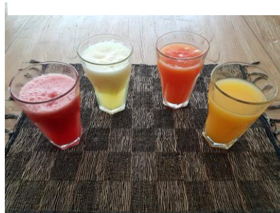
Orange Juice or seasonal Freshly Squeezed Juices