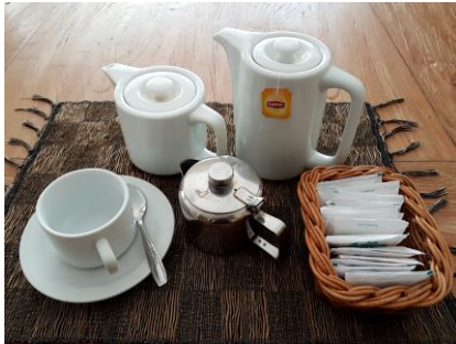
Bali coffee or pot of Tea